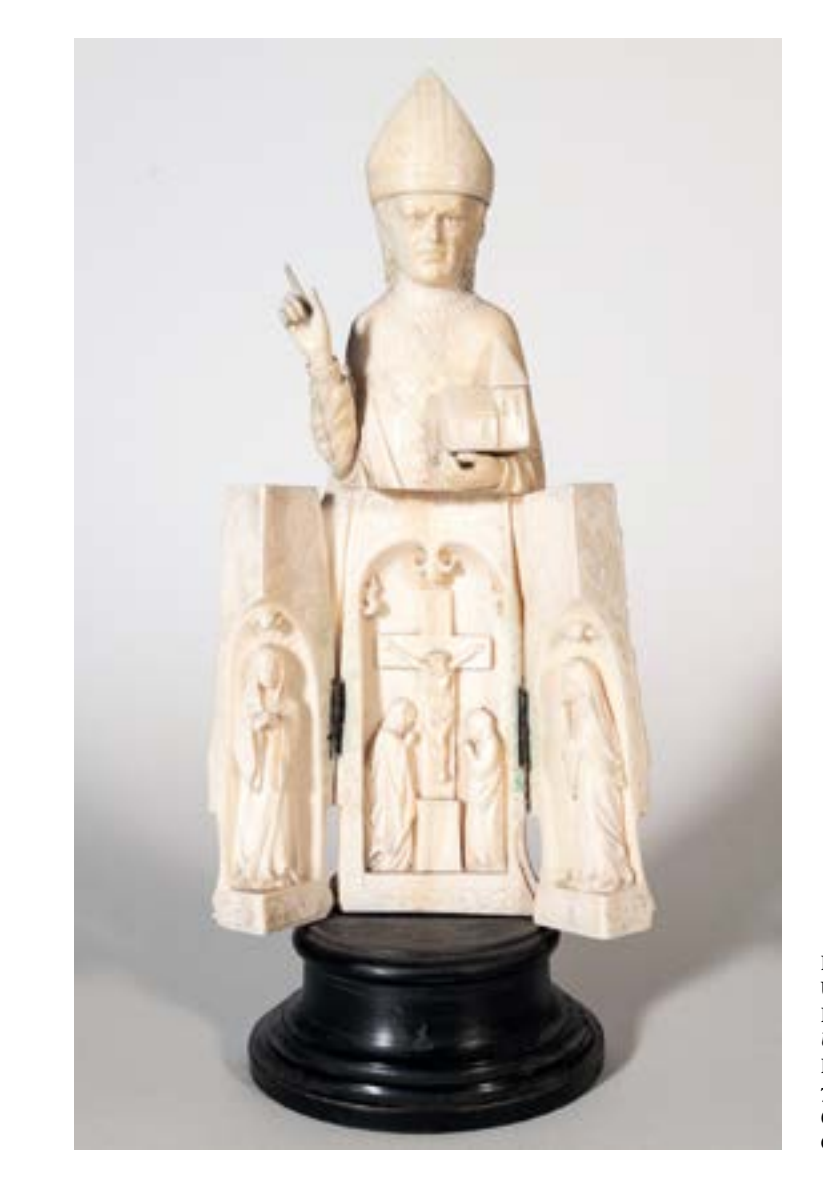
Plate 3 Unknown Artist Italian Untitled (Mitred Bishop) , (n.d.) Ivory 7 I/2 x 4 I/4 x 2 in 68.4 Gift of Mrs. Jean Messmer

An example of the post-medieval adoration of the Eucharist can be seen in this exhibition's nineteenth century brass Monstrance (61.12). A circular pane of glass in the center is meant to display the Eucharist wafer, which is surrounded by metal rays, symbolic of the light of Christ. The metal rays are typical of monstrances after the Middle Ages, as medieval examples have Gothic spires and arches