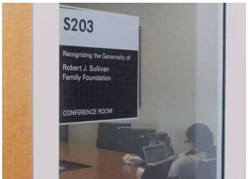
Examples of donor recognition at the Marquette Dental School.