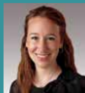
School of Dentistry Young Alumna of the Year