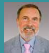
School of Dentistry Outstanding Dental Service Award Recipient