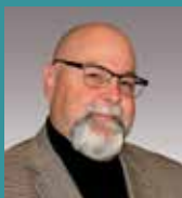
School of Dentistry Distinguished Alumnus in Dentistry